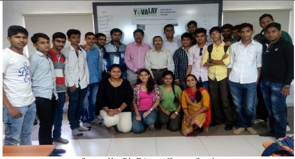
Summer Man-Edu-Tainment (Summer Camp)