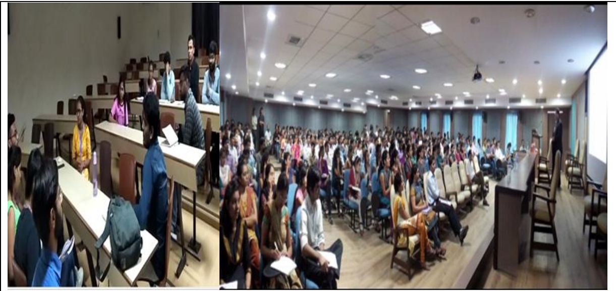
Placement Assistant Programme Activities