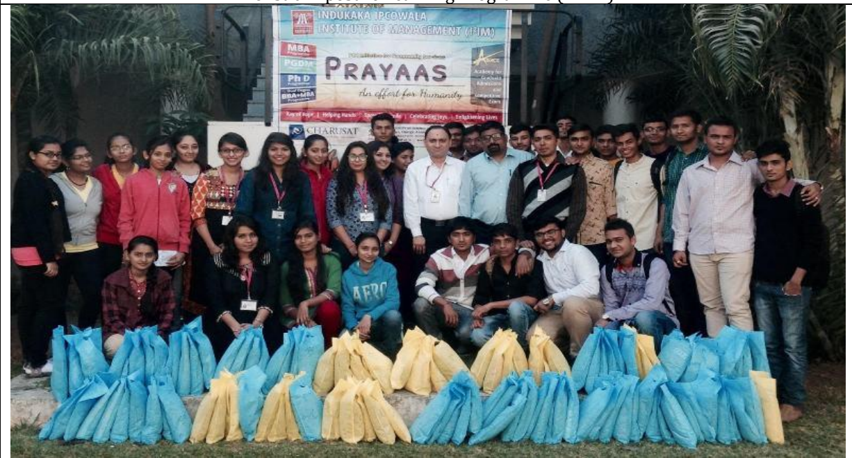
Community Club-Prayaas (Extension Activities)- Woollen Clothes distribution to needy people

Holistic Exposure Learning Programme (HELP)