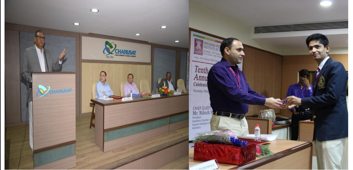
Annual Day Celebrations / Awards