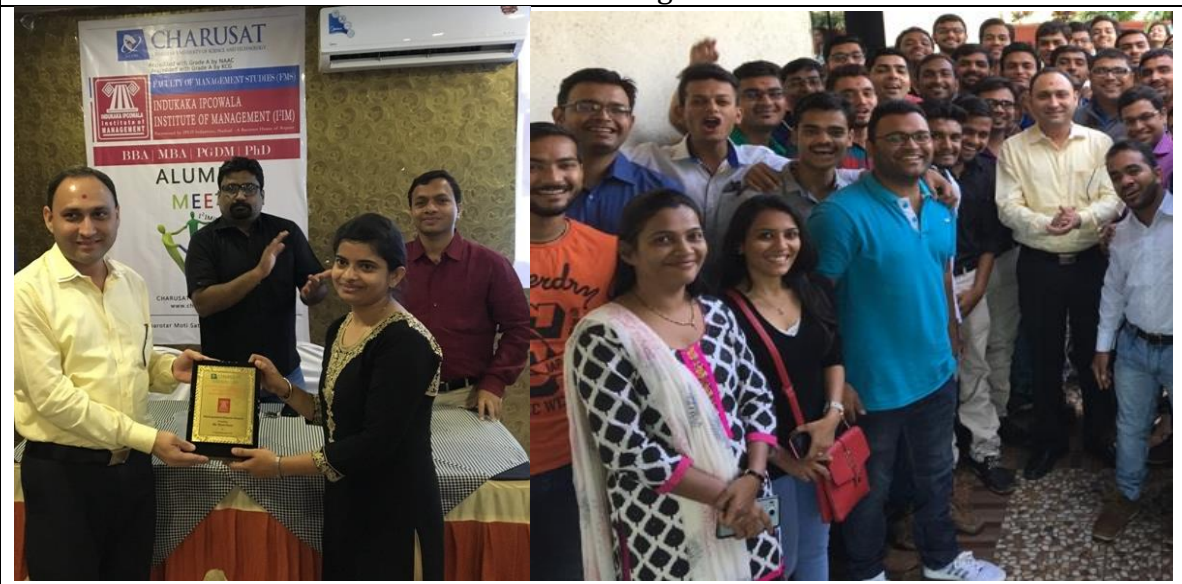
CAA - IIIM Chapter - Alumni Meet & Alumni Award Distribution