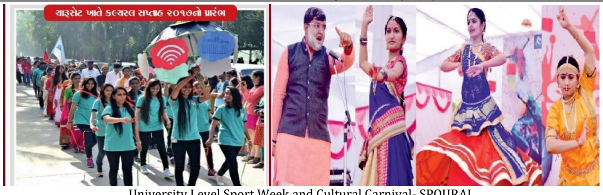
University Level Sport Week and Cultural Carnival-SPOURAL